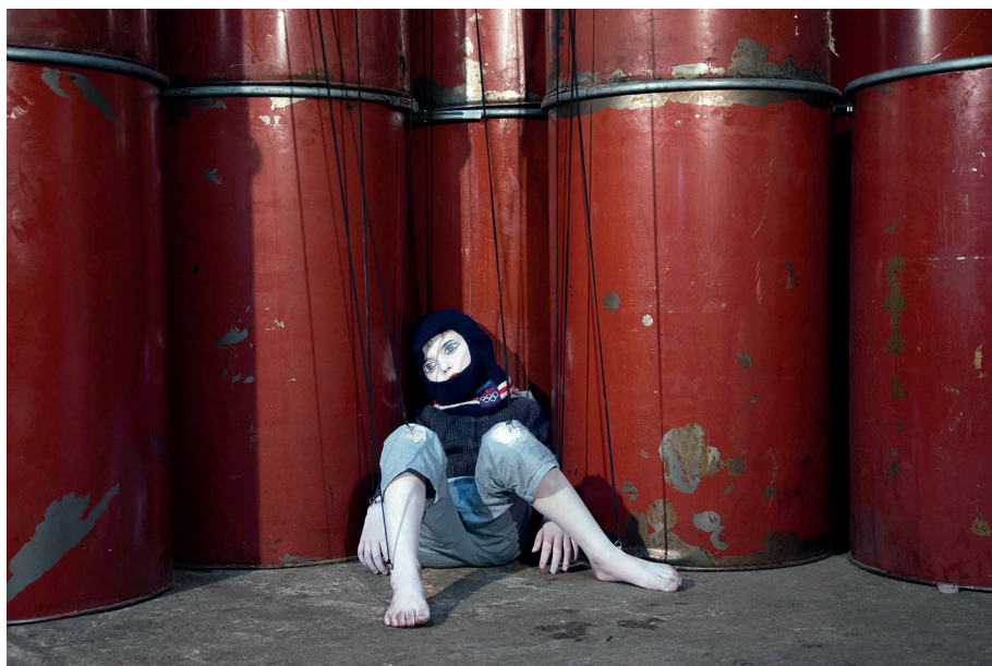
Pinocchio 4.5 © Alice Laloy