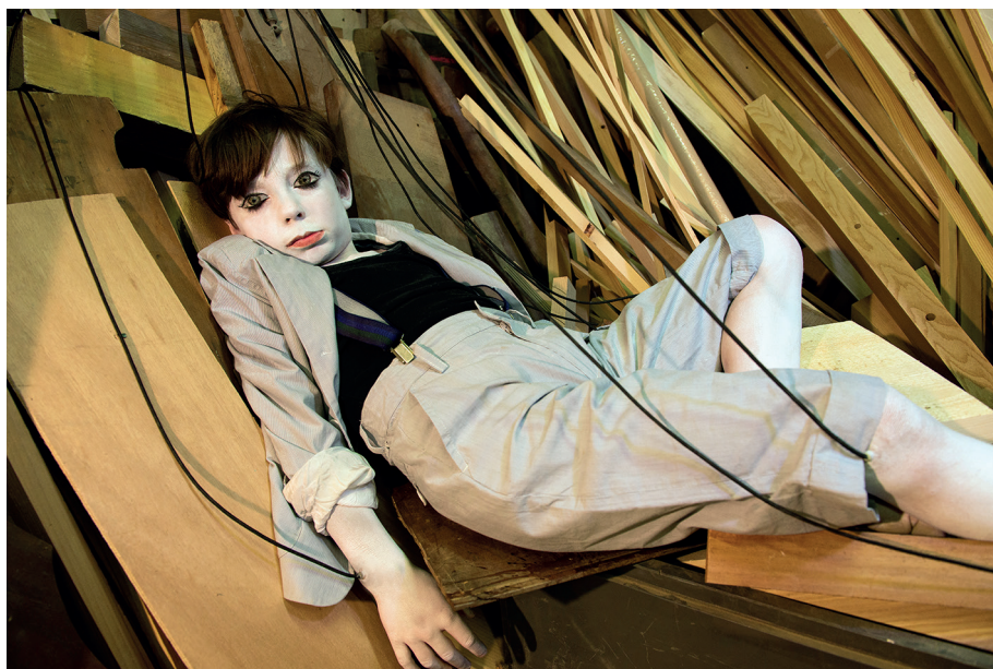
Pinocchio 1.7