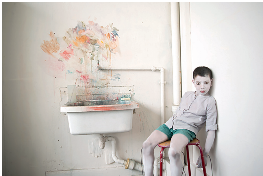
Pinocchio 1.4