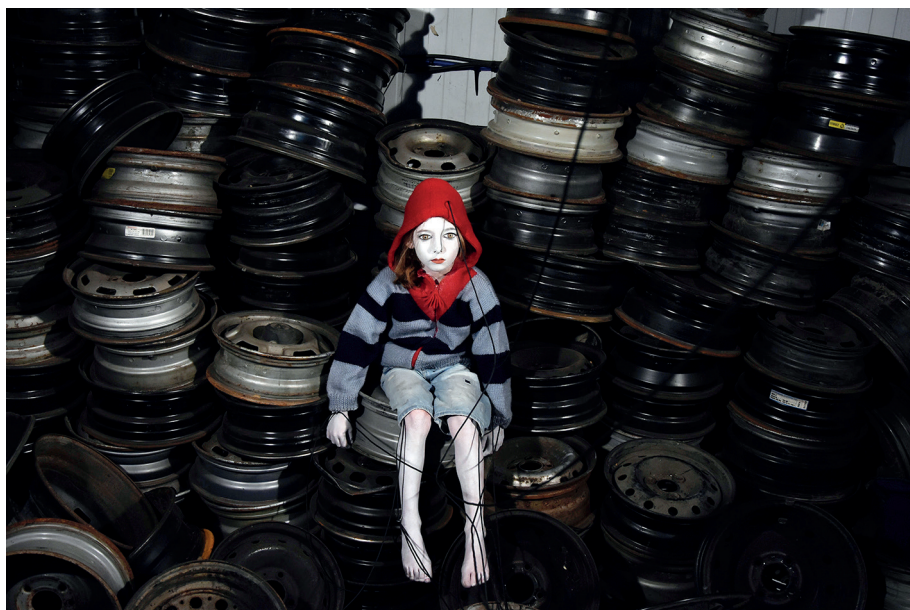
Pinocchio 4.6 © Alice Laloy