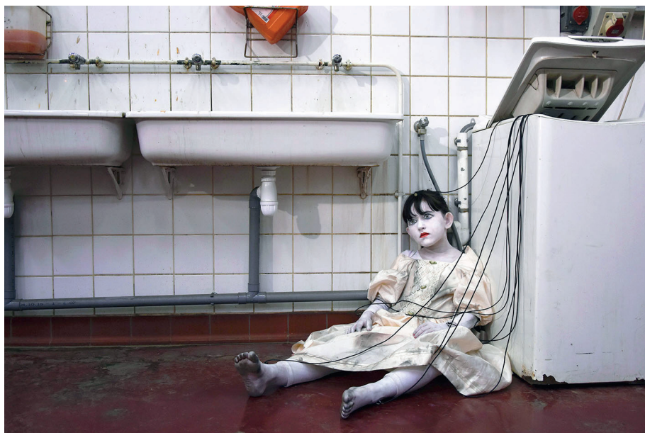
Pinocchio 4.7 © Alice Laloy